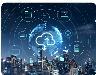
DIGITAL STRATEGY & TRANSFORMATION

Our gamut of digital services helps organisations uncover new growth avenues, reduce costs, improve risk management, and build better customer experiences by leveraging the power of modern technologies. We are adept to work with businesses at each step of this transformational journey, right from strategy through execution to delivering tangible business outcomes.