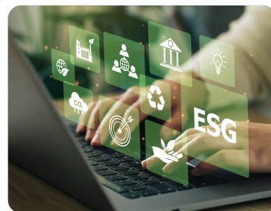
MICROSOFT CLOUD FOR SUSTAINABILITY